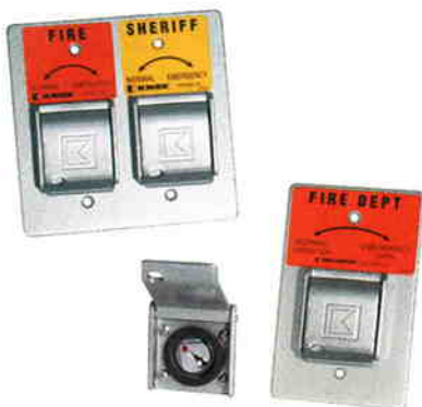
Key Switch / Heavy Stainless Cover