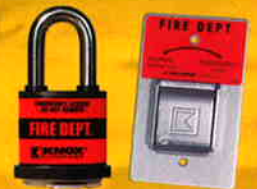
Padlocks, Key Switches