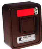
Lift-off Door Surface Mount