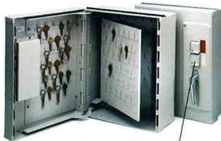
Armored Key Cabinet