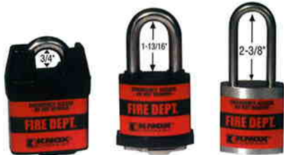
3772 Shrouded All Weather Use 3770 All Weather Use 3771 Interior Use

As the property owner, you purchase a KNOX-BOX® device then mount it near your building entrance or property gate according to fire department guidelines. Firefighters use a unique high security Knox® Master Key to open KNOX-BOX devices in their jurisdiction.