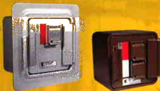
Knox-Vault ® 4100 Series