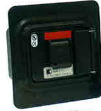
Hinged Door Recessed Mount