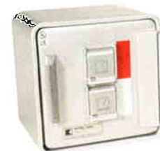
Dual Lock Option Surface Mount