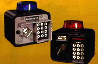
Master Key Retention