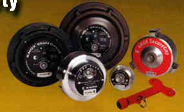
FDC Protection Products