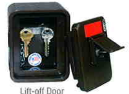
Lift-off Door Surface Mount