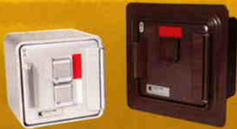
Knox-Vault ® 4400 Series