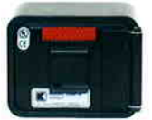
Hinged Door Surface Mount