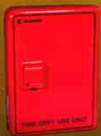
Knox Elevator Lobby Box