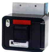
Hinged Door with Temporary Door Hanger