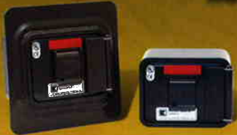
Knox-Box ® 3200 Series

Helping the Fire Department Protect Your Property