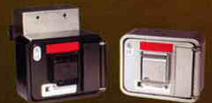
Knox Residential Products

KNOX-BOX ® access provides faster emergency response without forced entry damage.